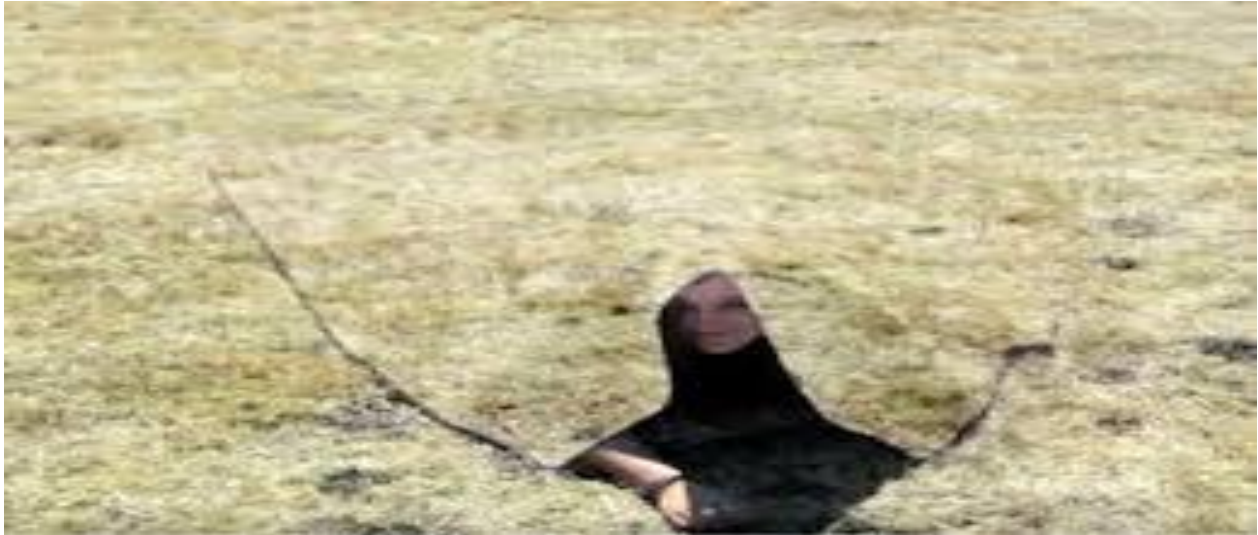
http://www.youtube.com/watch?v=Rqi3jpBSyCc (invisibility cloak)