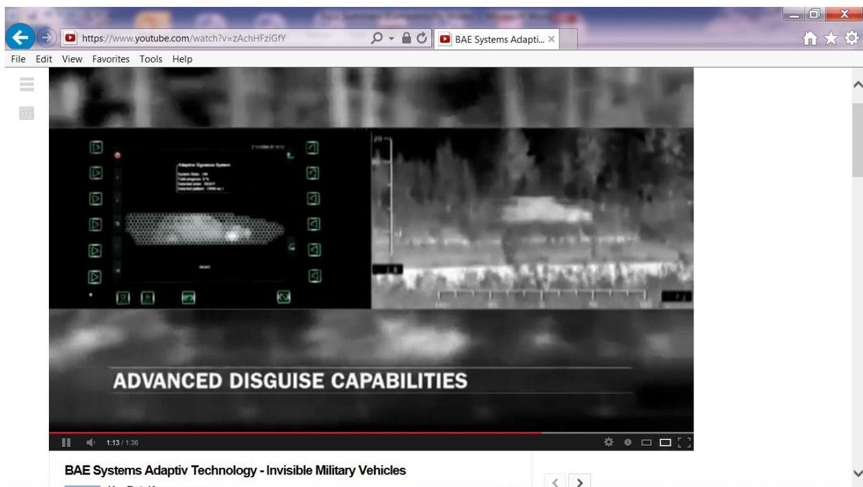
http://www.youtube.com/watch?v=KL_KdmSTSNA (invisibility vehicle)